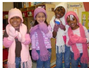
NEON Child Development pre-school children model new hats, mittens & scarves made by RSVP volunteers!